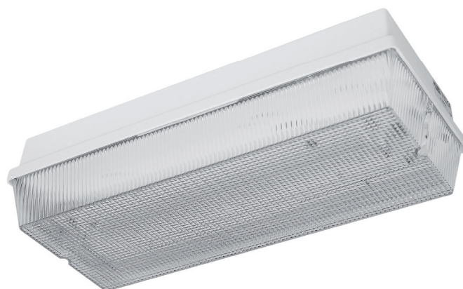
HBI Bisscheroux B.V. 4L09--HOR 400 HOR/ LVK (polair)